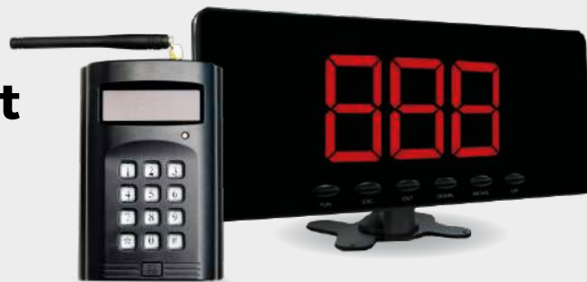
1 SERIES 200Q